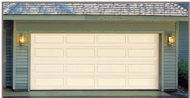
RANCH FOUR PANEL DESIGN